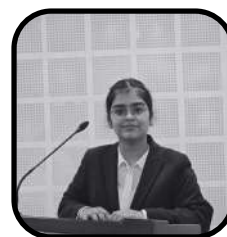
Aayushi International Logistics Head